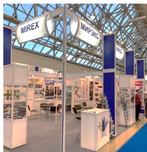
On the photo: MIREX's stand

The company is a supplier of new and used equipment for the production of textiles, knitwear, technical fabrics and nonwoven materials. Spare parts, components, technical equipment, consumables. More than 30 years of presence on the Russian market.