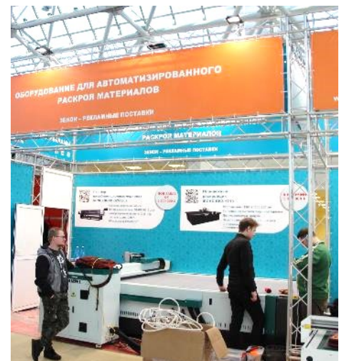
On the photo: equipment preparation of ZENON ADVERTISING SUPPLY