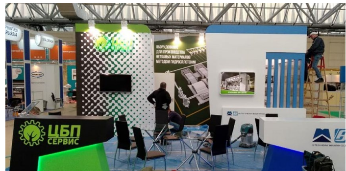
On the photo: installation of CBP-SERVICE stand

Supply of equipment for production of nonwovens and textiles.