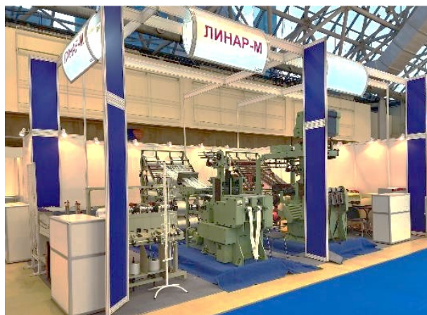
On the photo: stand with Linar-M equipment