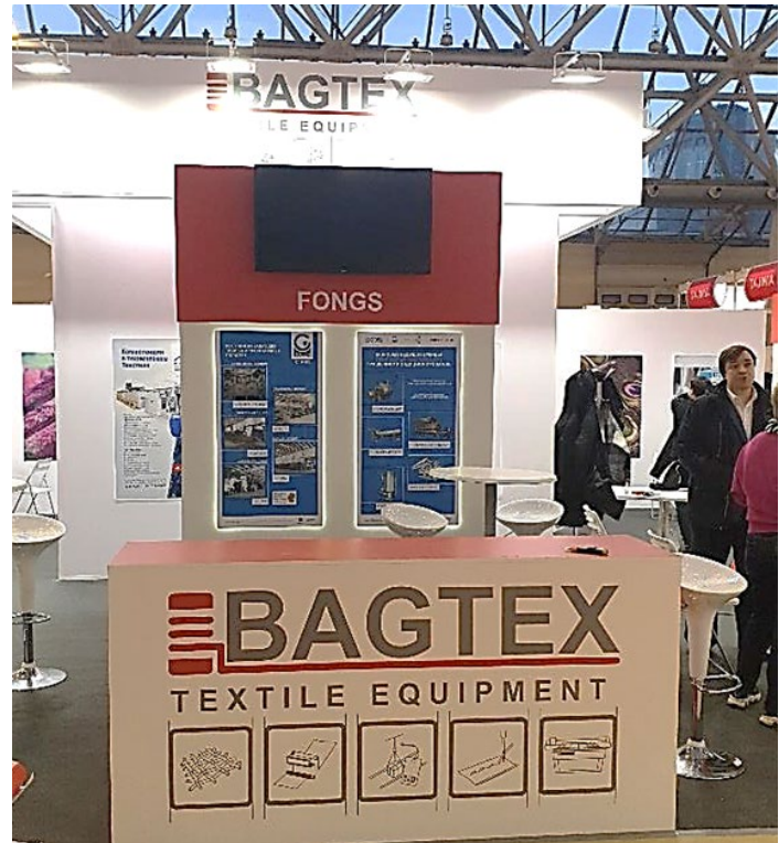
On the photo: BAGTEX stand preparation

Technical solutions for the textile industry, including consulting, engineering and sales of textile equipment. The company is one of the representatives of the world manufacturers of textile machines and equipment for production of nonwoven materials and technical textiles.