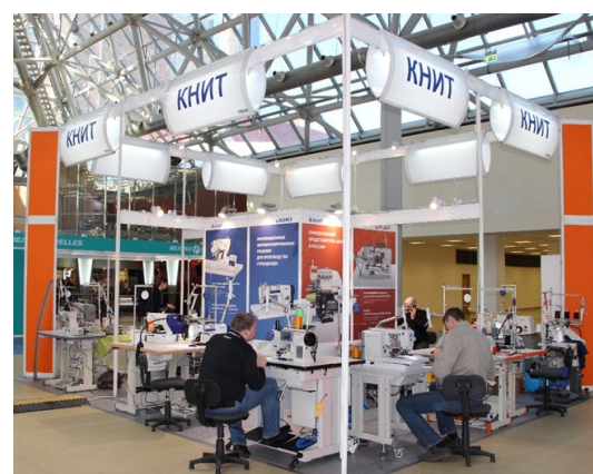
On the photo: KNIT equipment preparation

The company provides supply and service of industrial sewing machines from the leading world manufacturers at the best prices in Moscow.