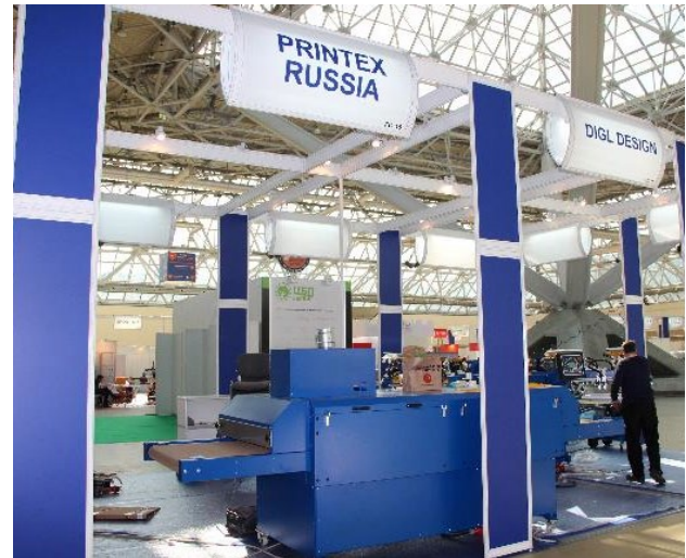
On the photo: PRINTEX RUSSIA equipment installation