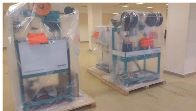
On the photo: equipment delivered from Germany by Herzog GmbH

Herzog GmbH is the market leader in braiding and rewinding machines. The company produces more than 500 types of equipment.