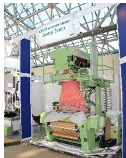
On the photo: Lenta Tex equipment installation